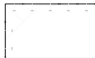
Floor plan CORNER STAND, 8 m 2