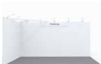
Example image CORNER STAND, 8 m 2