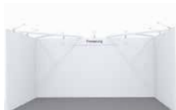
Example image ROW STAND, 8 m 2

Separate regulations apply to the Book Art & Graphic Arts exhibition area, which can be found in the Special Conditions of Participation.