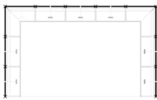
Floor plan ROW STAND, 15 m 2