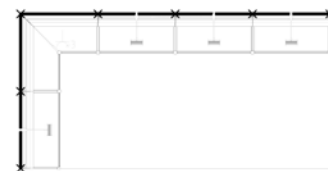
Floor plan CORNER STAND, 8 m 2