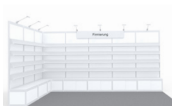
Example image CORNER STAND, 15 m 2