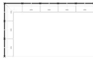
Floor plan CORNER STAND, 15 m 2