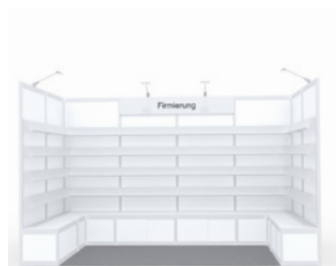
Example image ROW STAND, 8 m 2