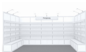
Example image ROW STAND, 15 m 2