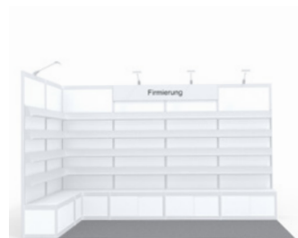
Example image CORNER STAND, 8 m 2